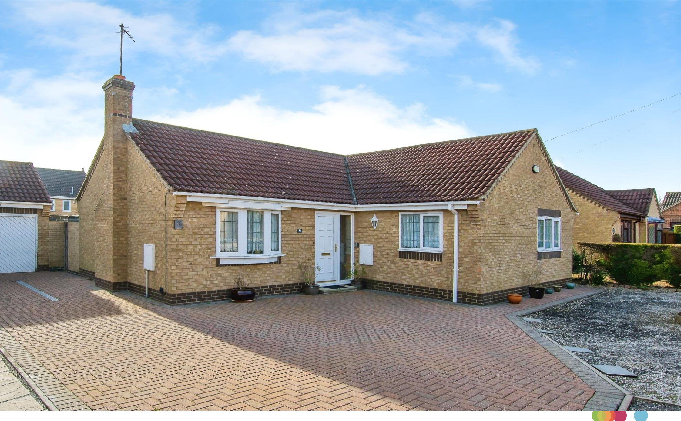
Field Rise, Yaxley Peterborough PE7 3YT