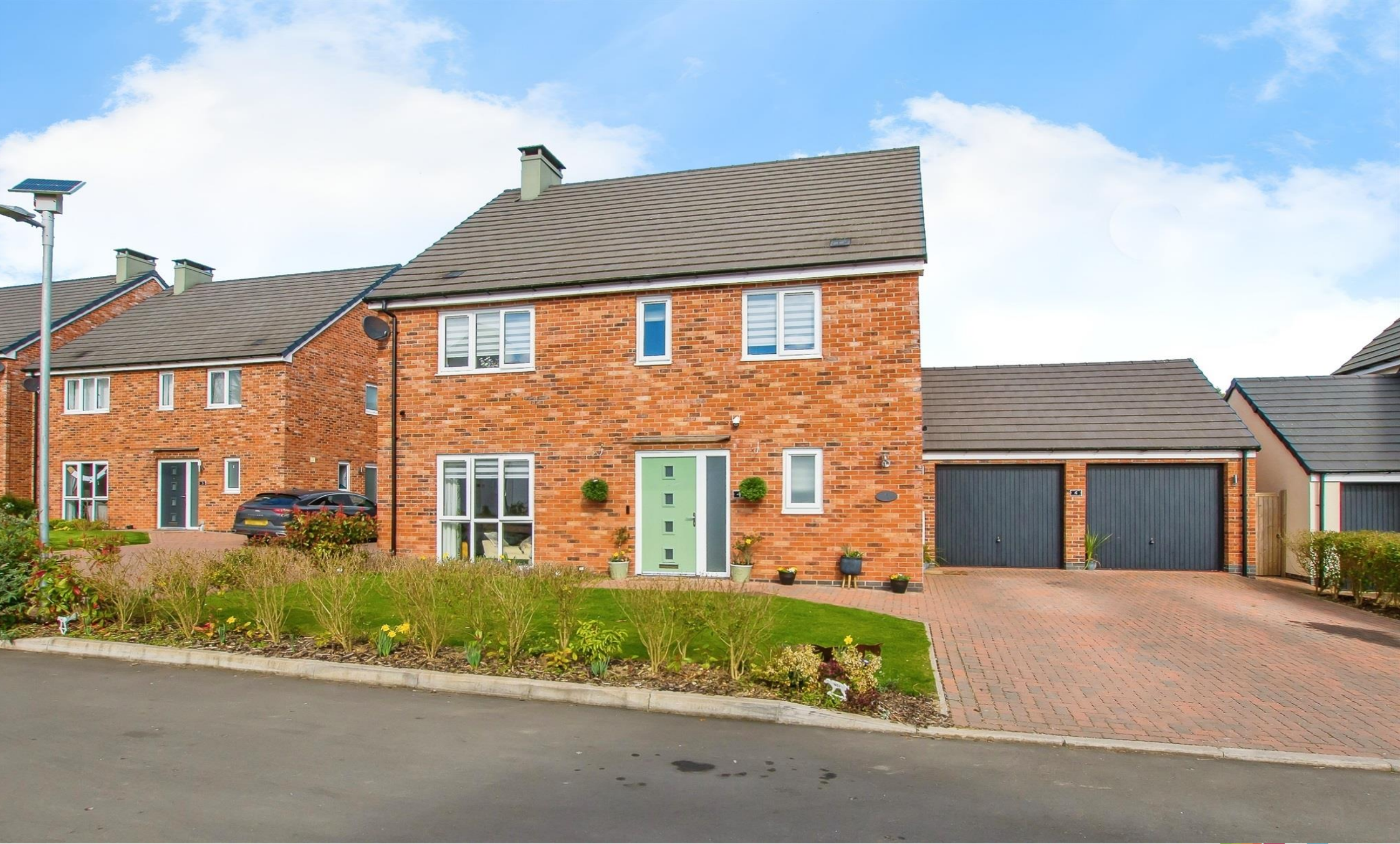
Thompsons Yard, Yaxley Peterborough PE7 3TA