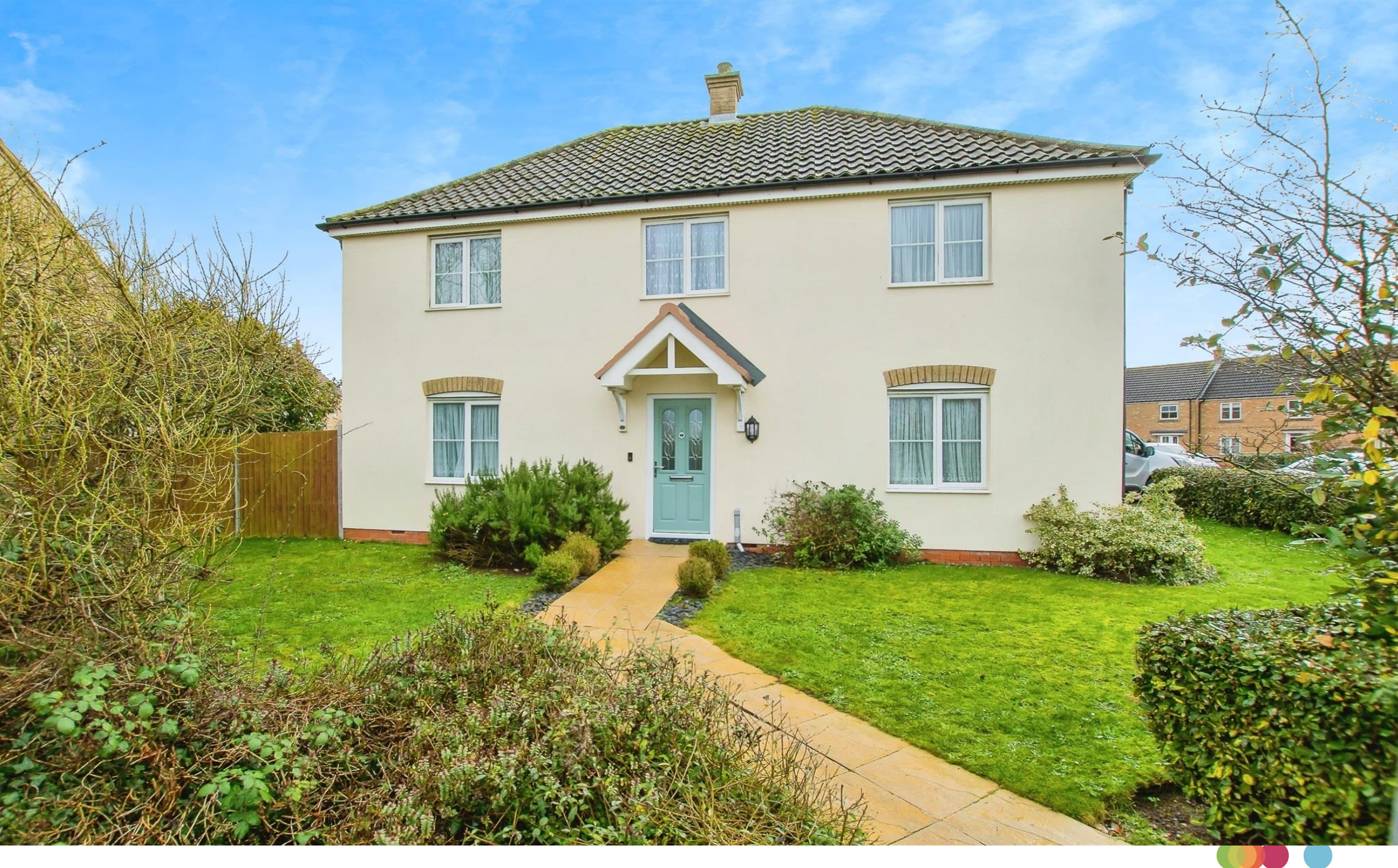
George Alcock Way, Farcet Peterborough PE7 3DU