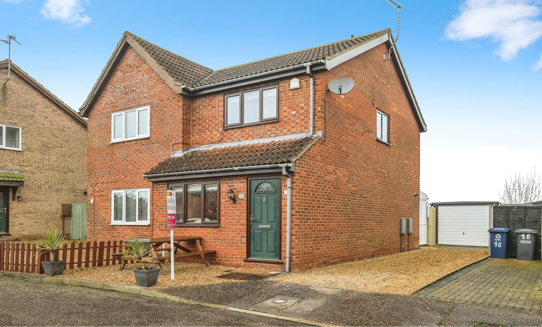
Meadow Close, Stilton Peterborough PE7 3FG