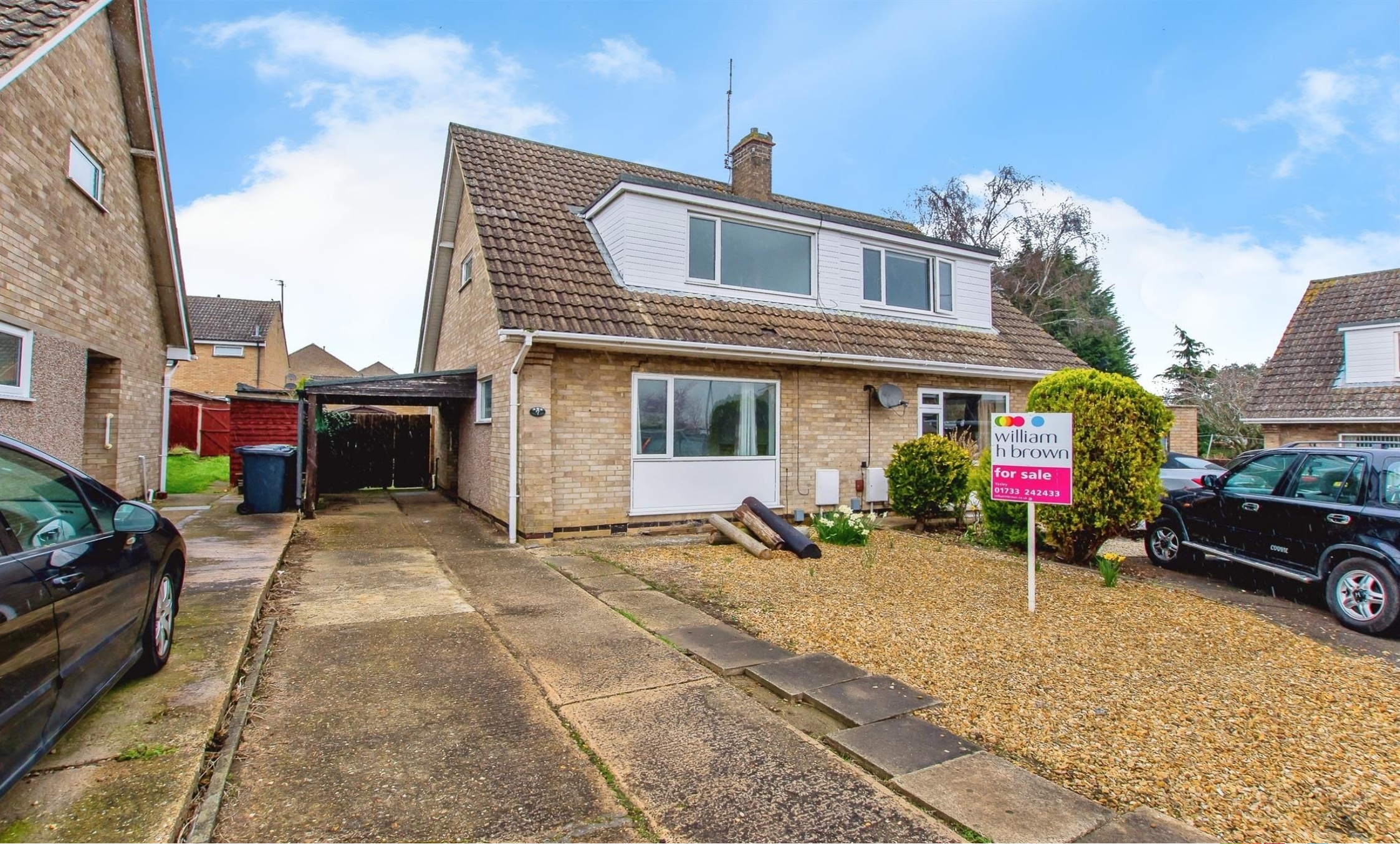
Badger Close, Yaxley Peterborough PE7 3JU