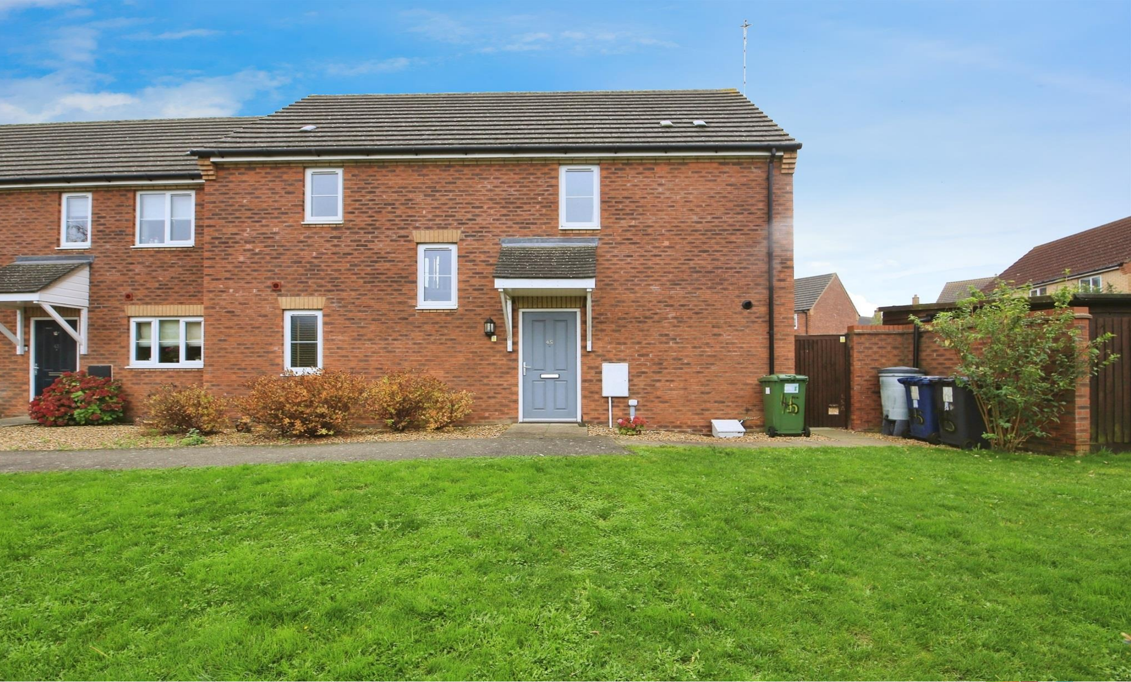
Thistle Close, Yaxley Peterborough PE7 3GF