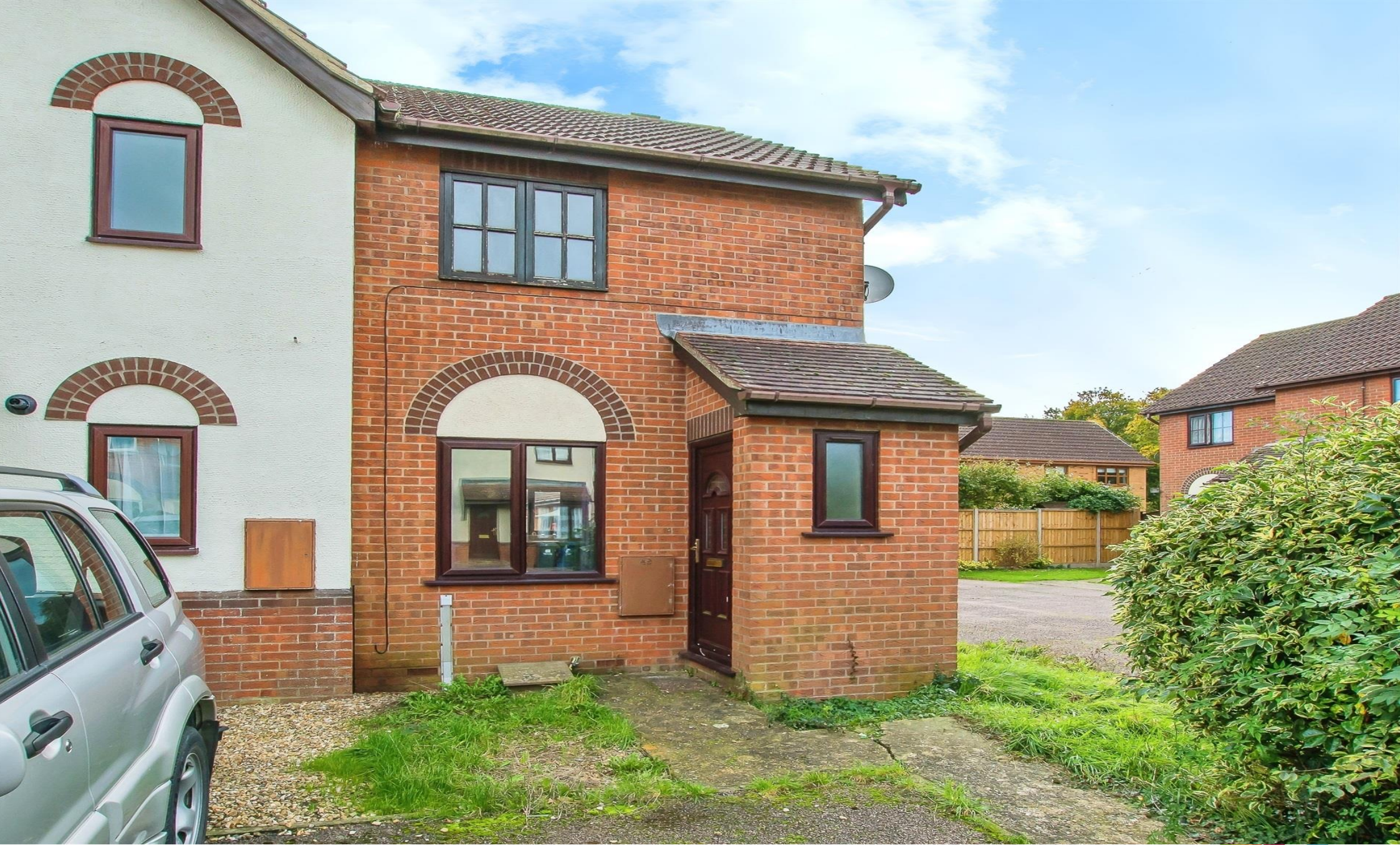
Annesley Close, Sawtry Huntingdon PE28 5RN