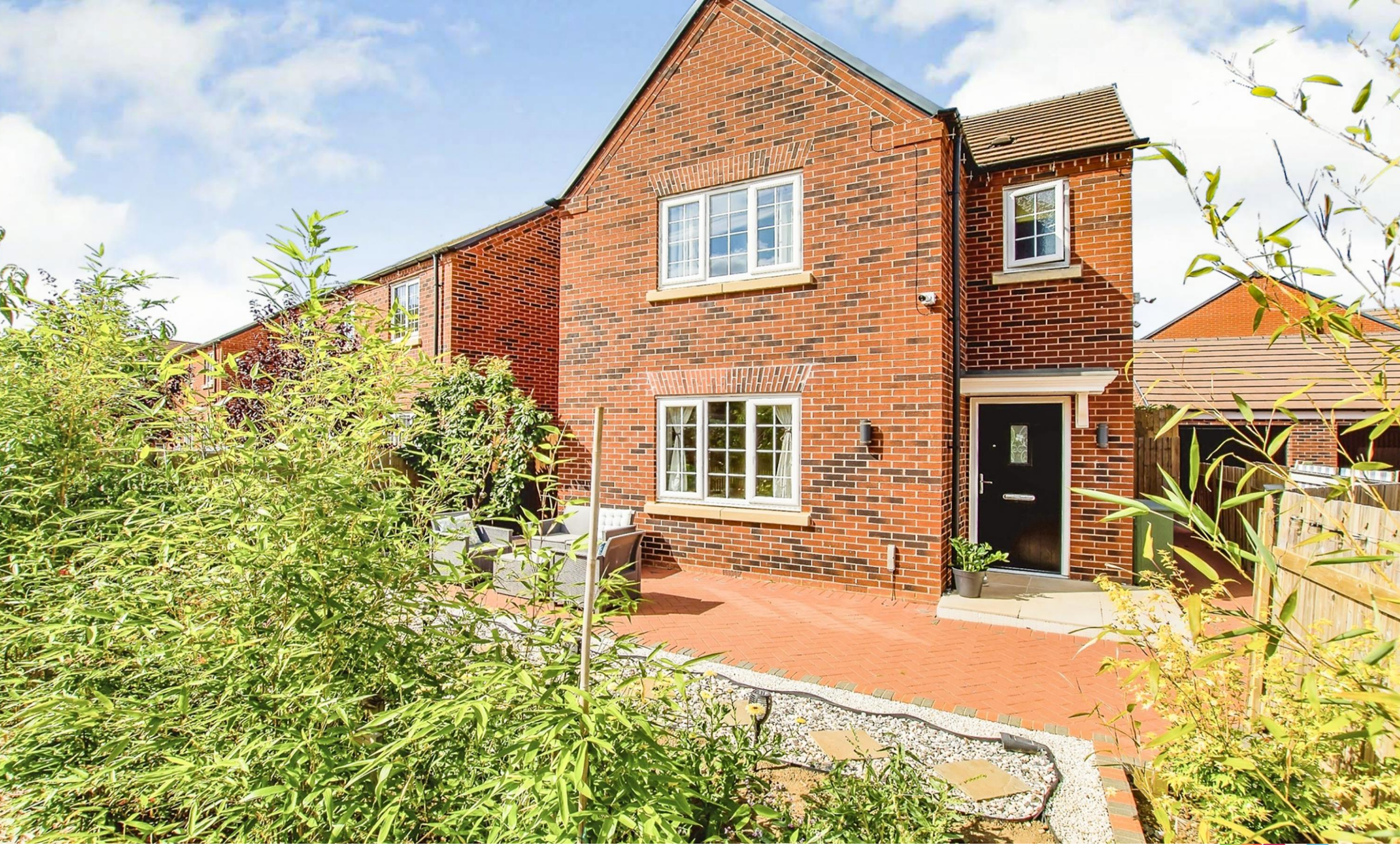
Brodie Place, Hampton Gardens Peterborough PE7 8QD