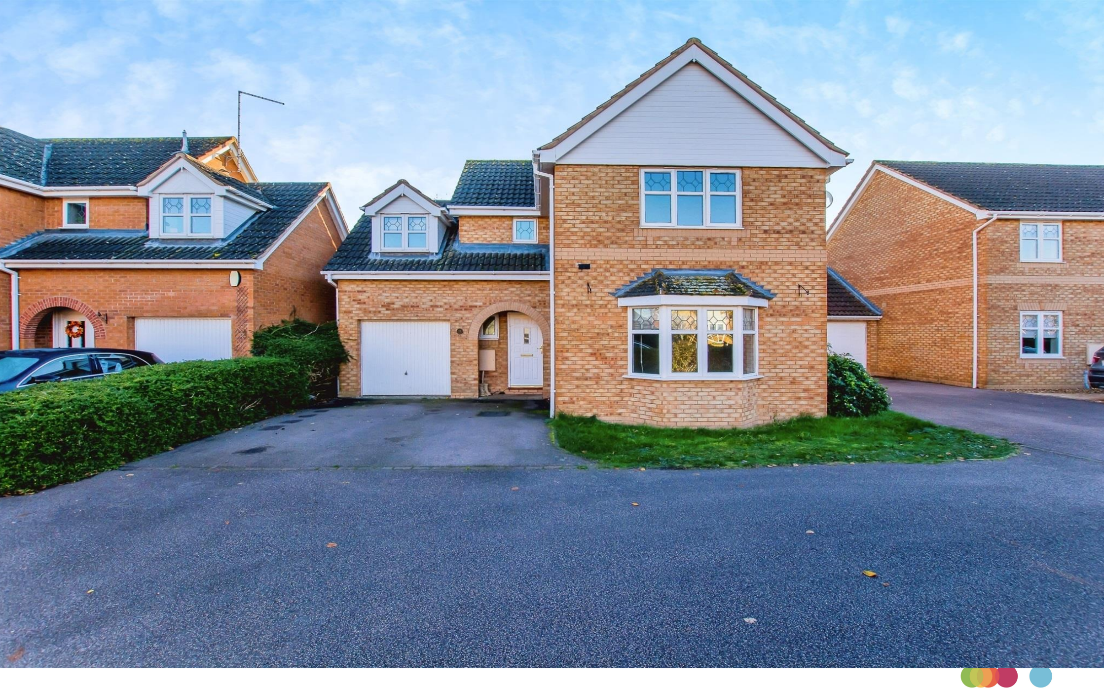
Ferndale, Yaxley Peterborough PE7 3ZQ