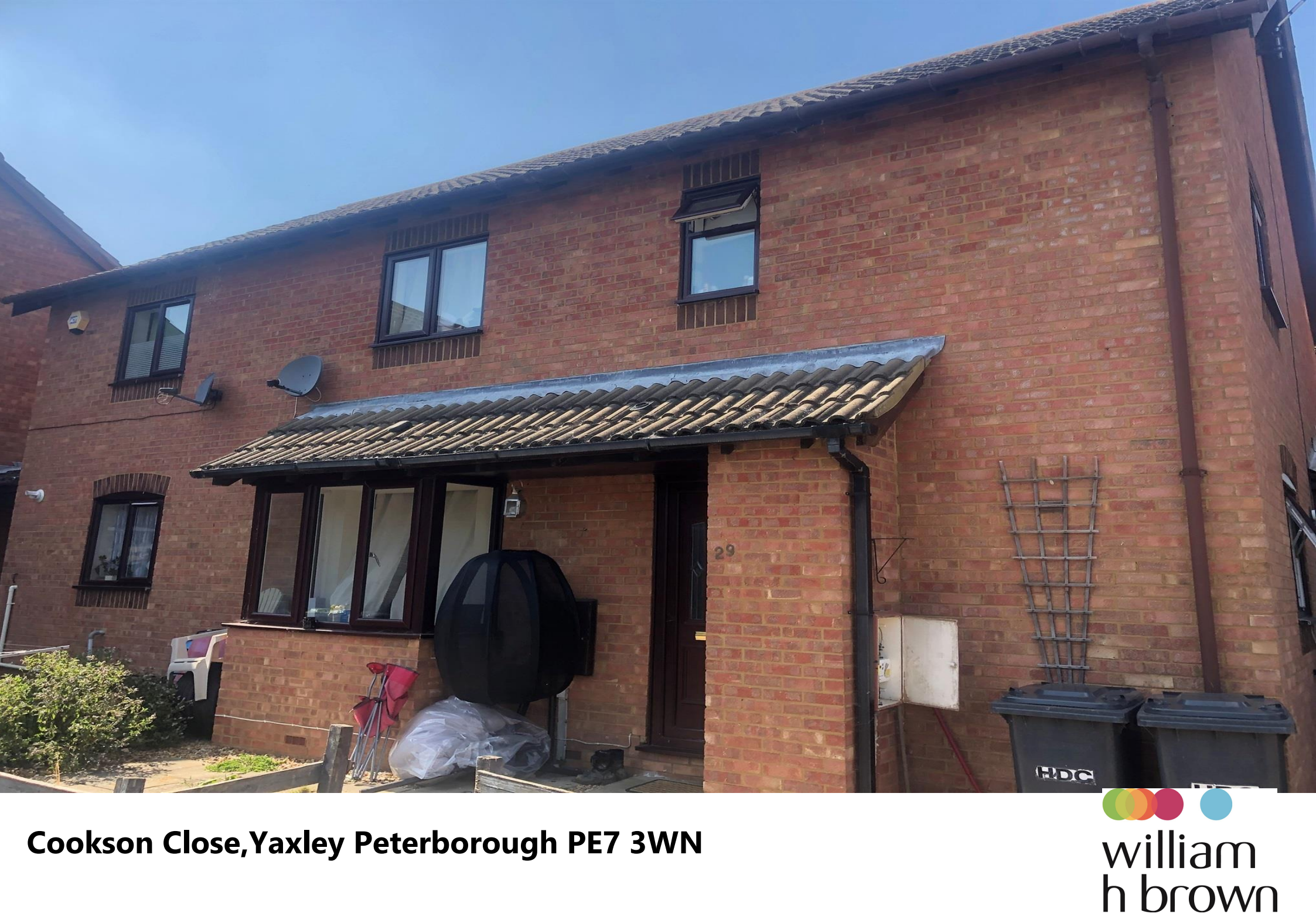
Cookson Close, Yaxley Peterborough PE7 3WN