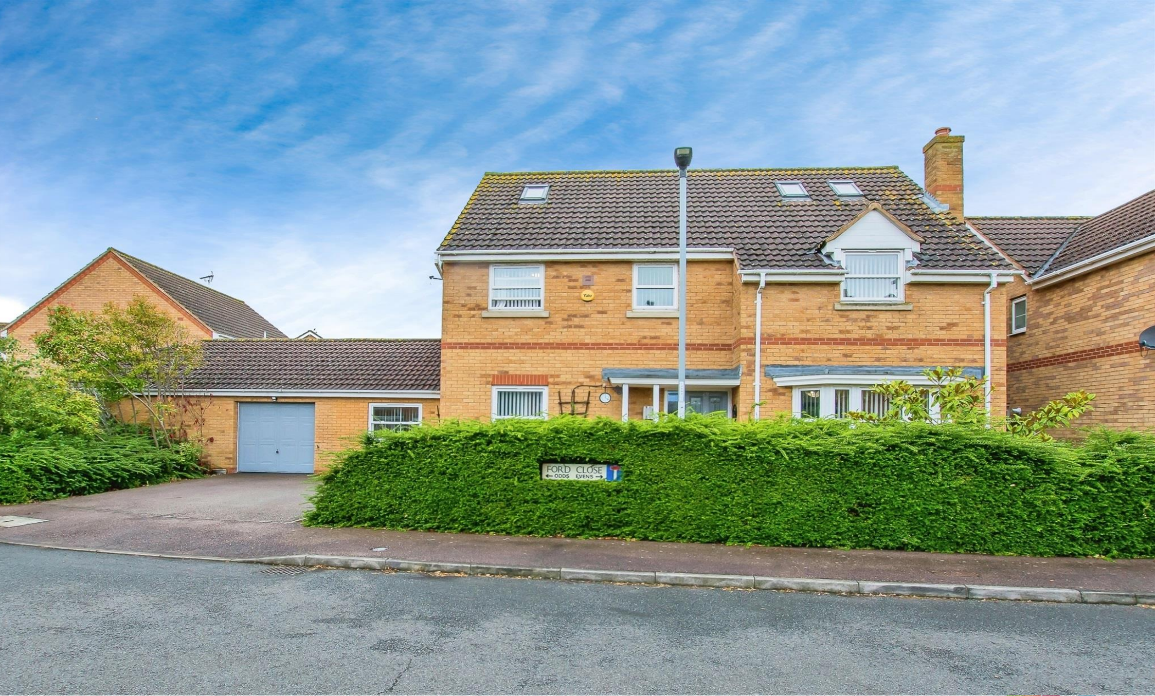
Ford Close, Yaxley Peterborough PE7 3DT