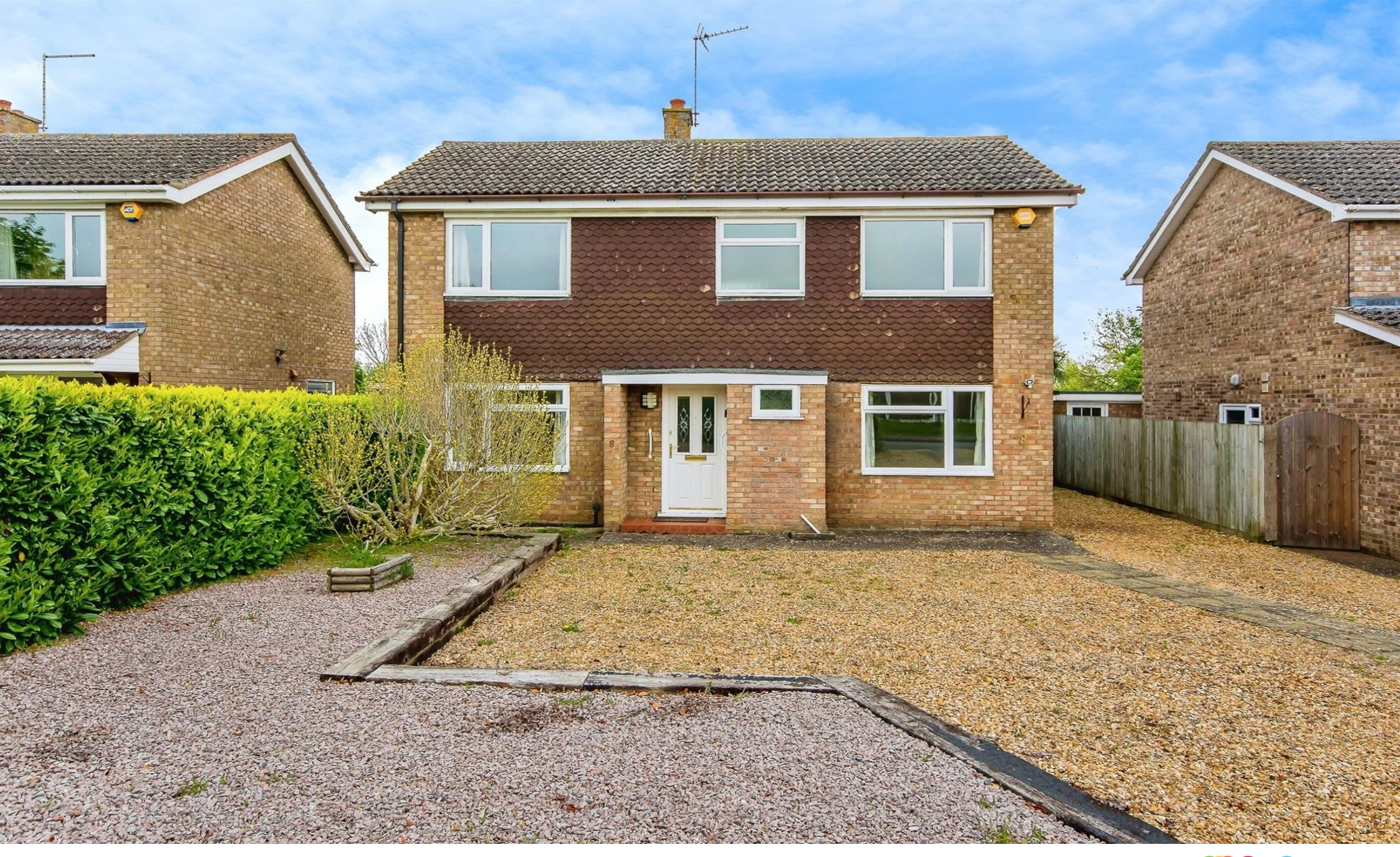
St. Marys Road, Stilton Peterborough PE7 3RX