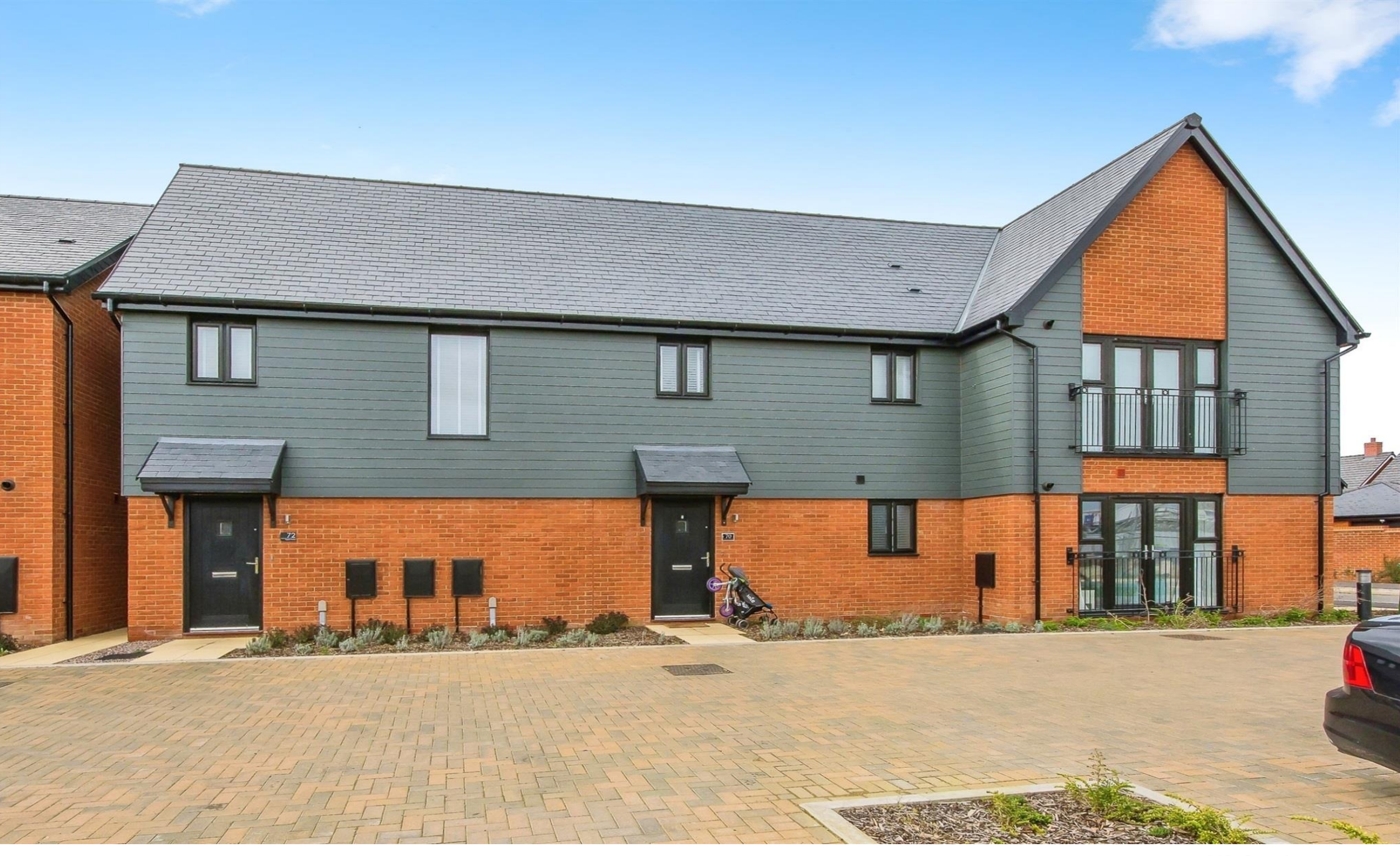
Tilgate Road, Hampton Water Peterborough PE7 8QT