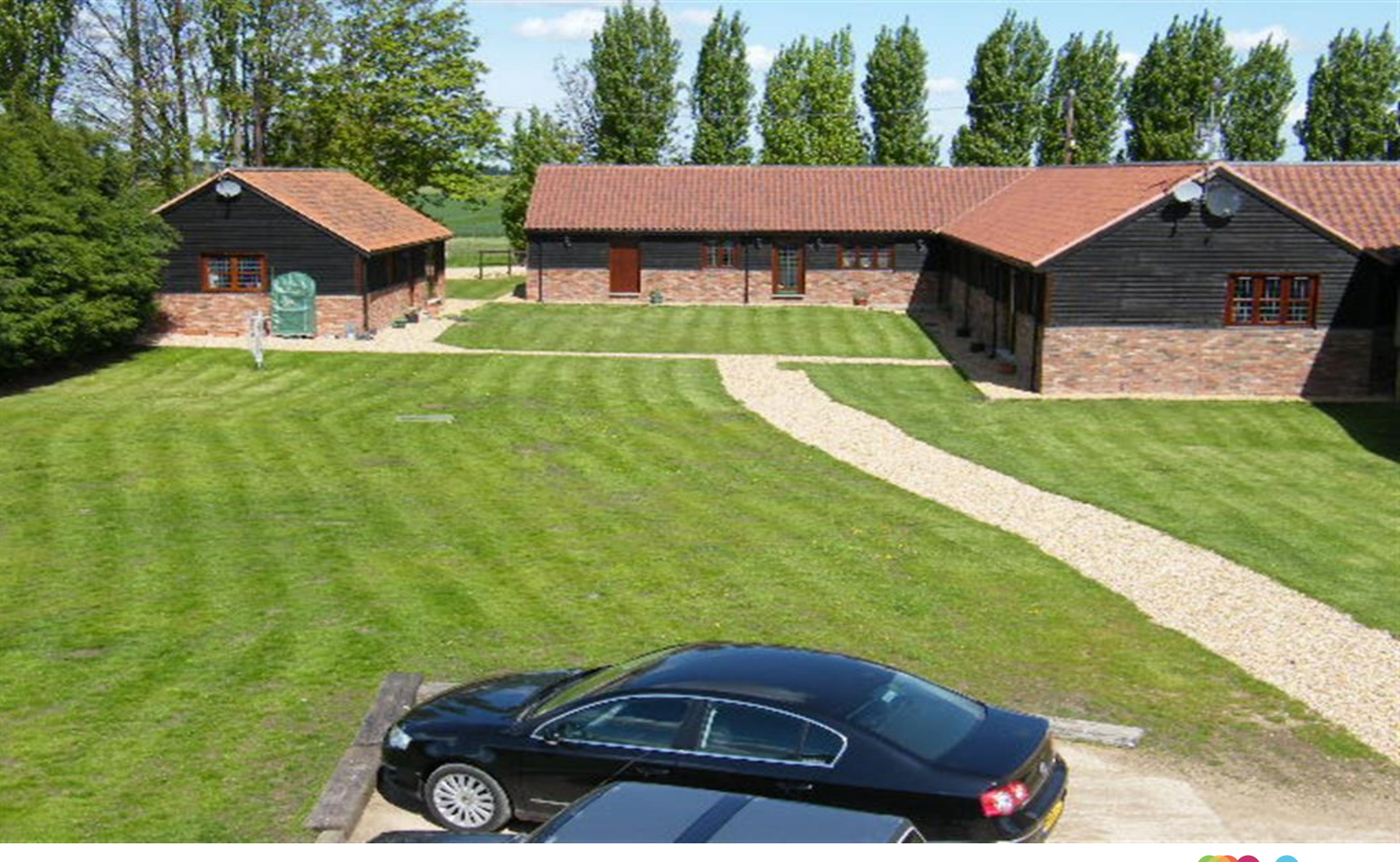
The Olde Grain Barn Glassmoor Bank, Whittlesey Peterborough PE7 2NA