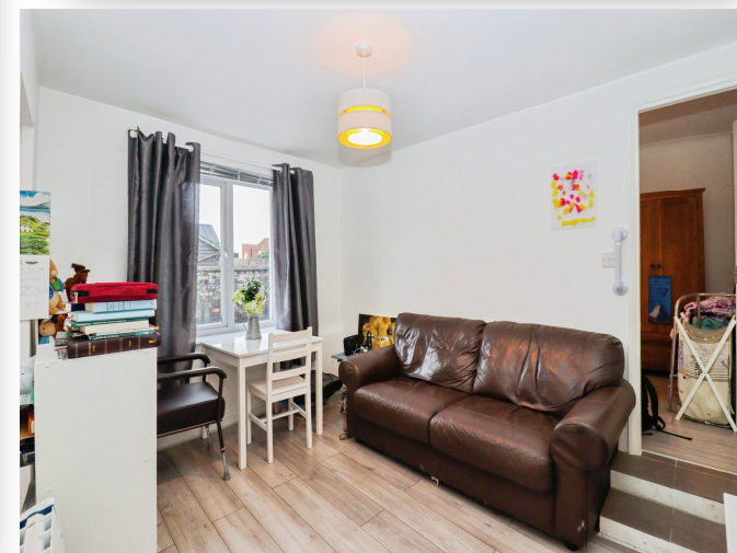
Friarscroft Lane, Wymondham NR18 0AT