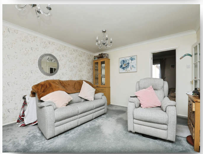
Orchard Way, Wymondham, NR18 0NZ