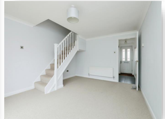
Esprit Close, Wymondham NR18 9LY