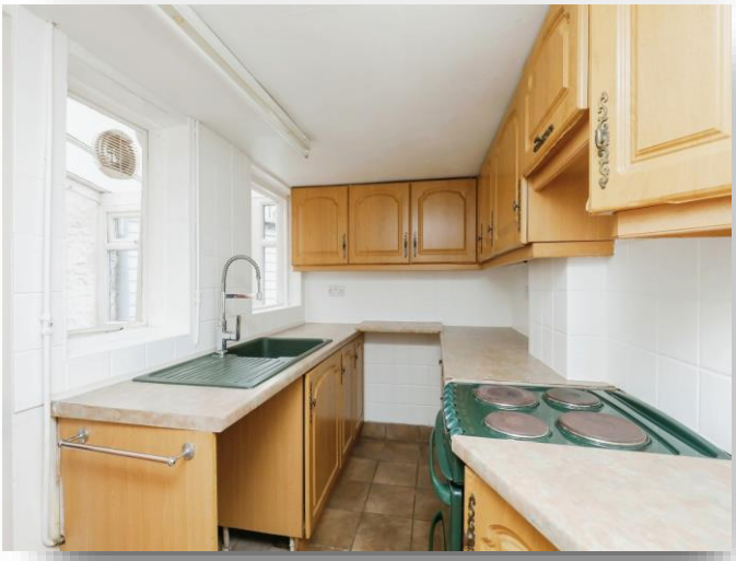
Elm Terrace, Wymondham NR18 0QD