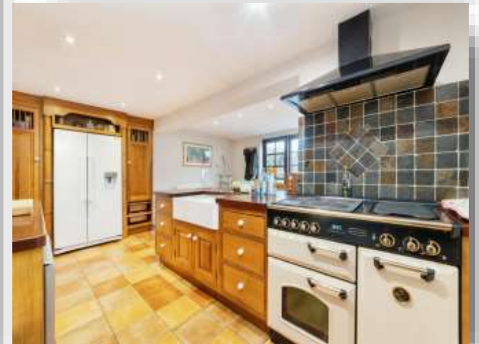
Mount Pleasant Rush Green, Barnham Broom Norwich NR9 4DU