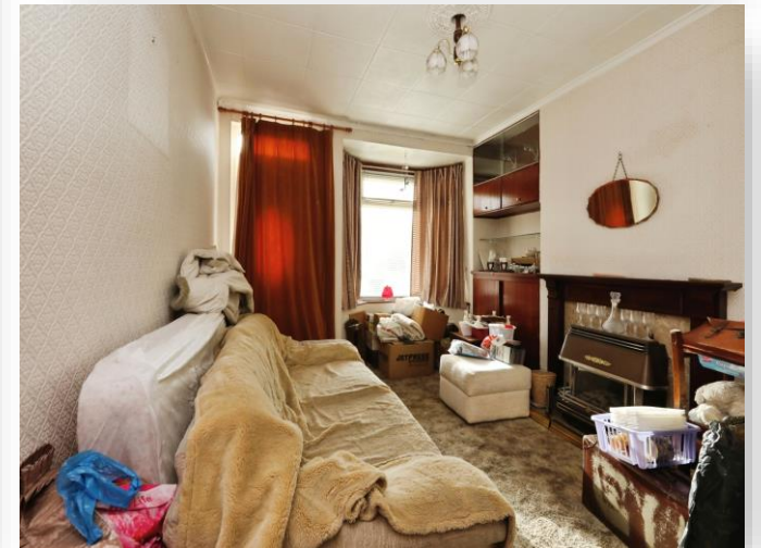
James Street, Worksop S81 7JD