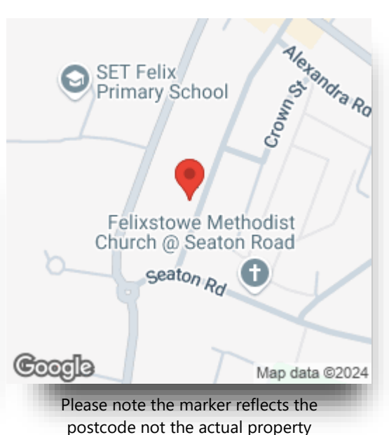
view this property online williamhbrown.co.uk/Property/WBG108957