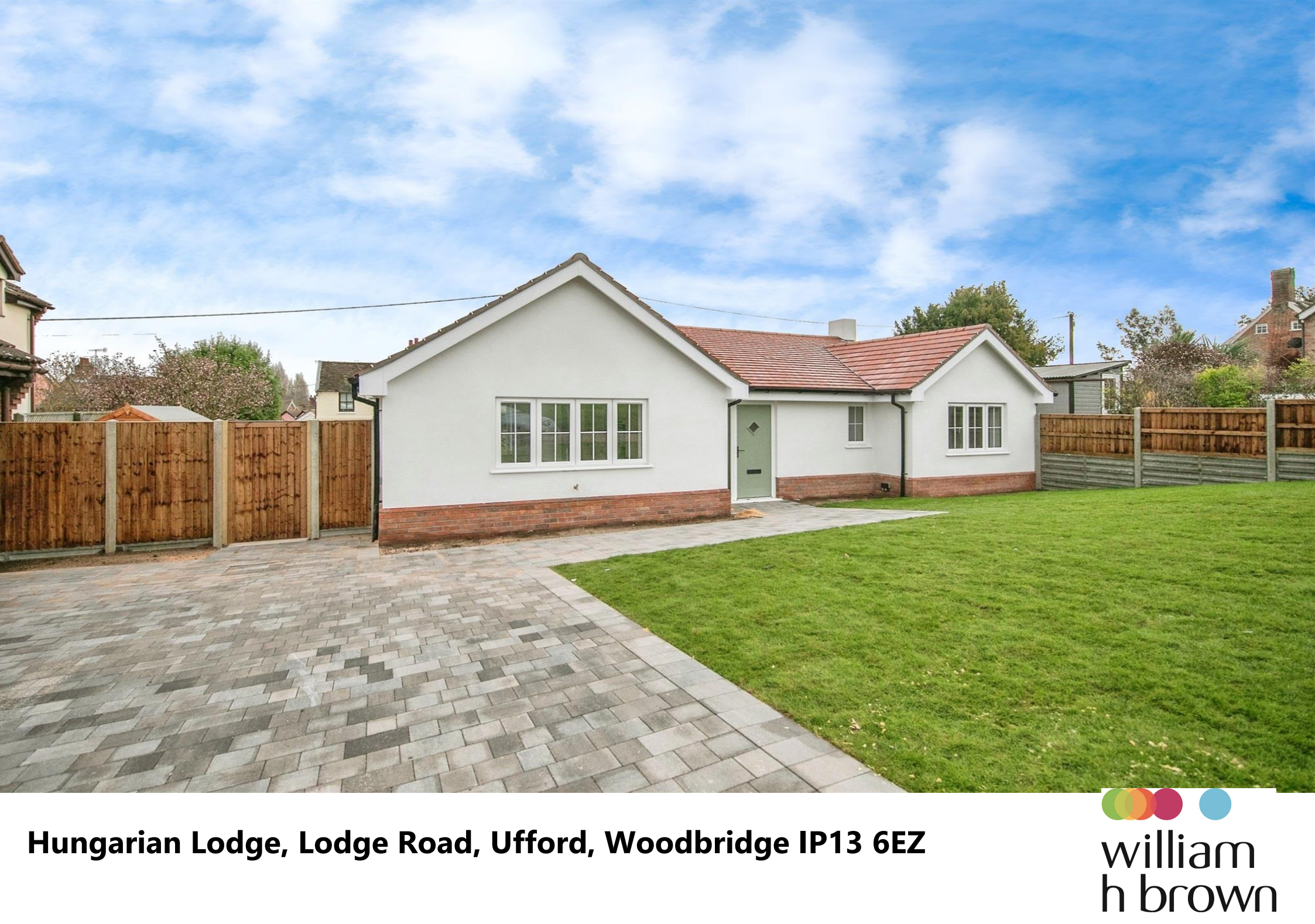
Hungarian Lodge, Lodge Road, Ufford, Woodbridge IP13 6EZ