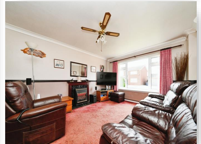
Cambridge Drive, Wisbech PE13 1SE