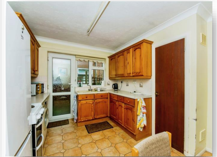
Pear Tree Crescent, Leverington Wisbech PE13 5AY