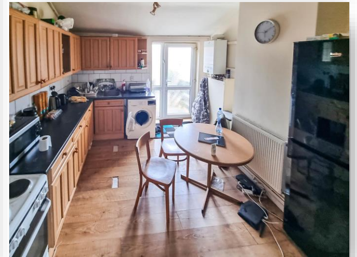
Norfolk Street, Wisbech PE13 2LF