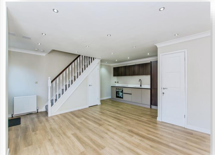
Bruce Court, Chapel Road Wisbech PE13 1RW