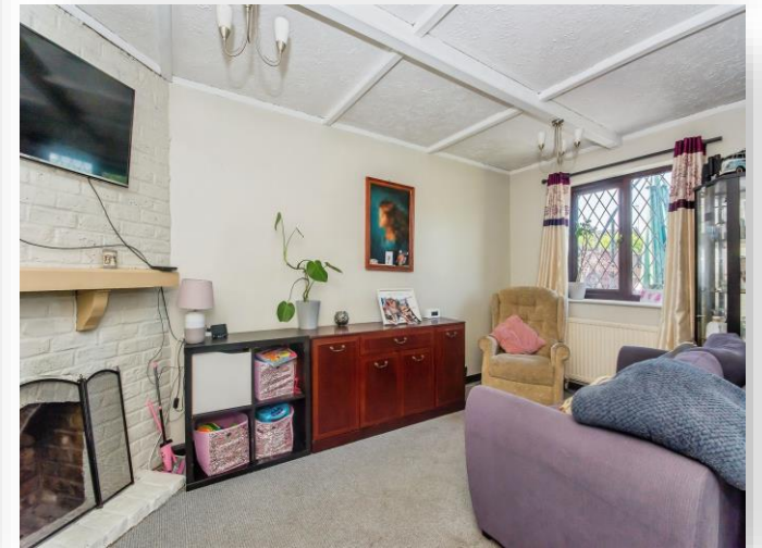
Richmond Way, Leverington Wisbech PE13 5JX