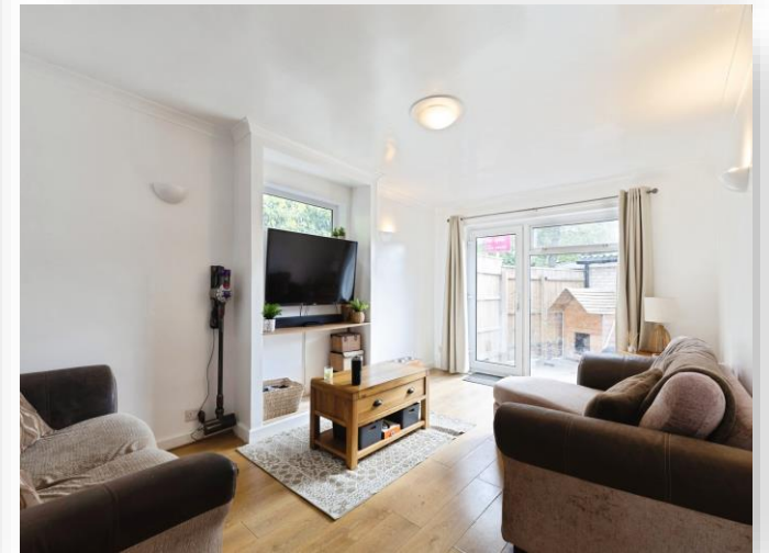
Medworth Place, Love Lane, Wisbech PE13 1HP