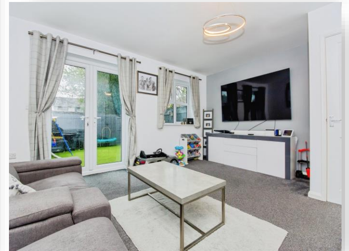
Fenmen Place, Wisbech PE13 3FA