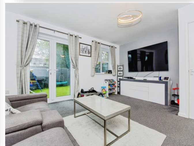
Fenmen Place, Wisbech PE13 3FA