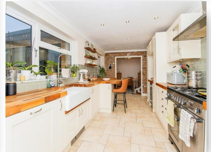
The Lodge, Wales Bank, Elm, Wisbech, PE14 0AY