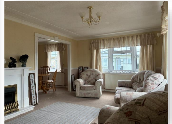
Fenland Village, Osborne Road, Wisbech PE13 3JR