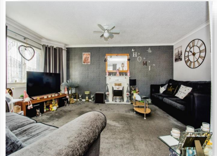
Fenland Village, Osborne Road, Wisbech PE13 3JR