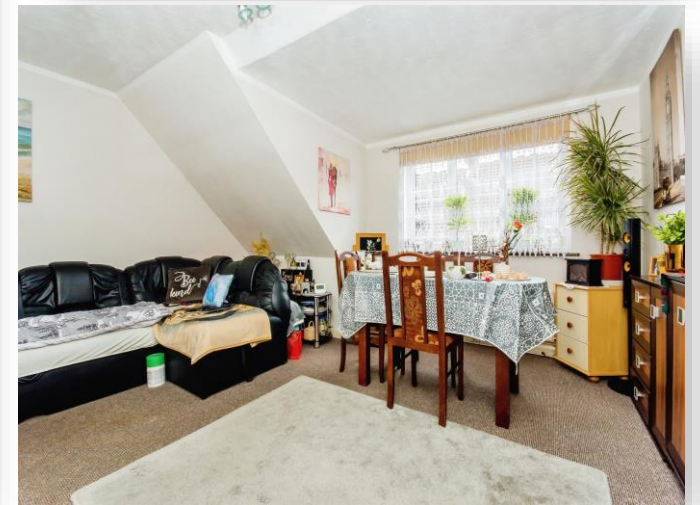
Church Mews, Wisbech PE13 1HL