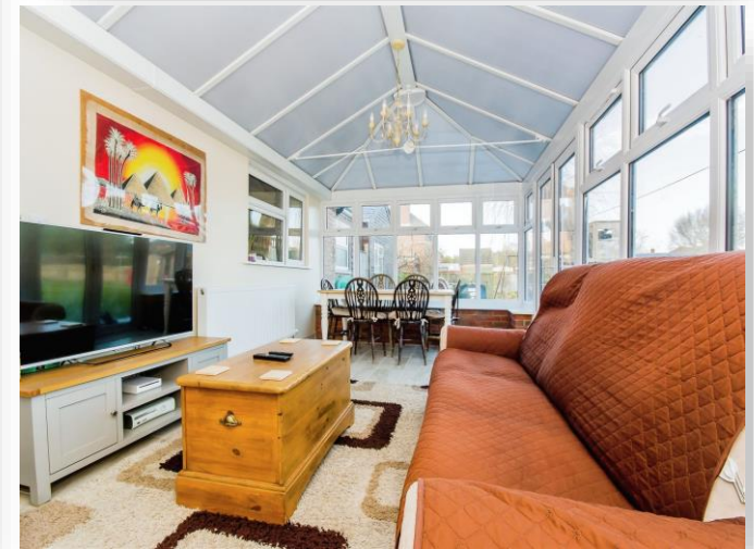
Glenfield Close, Outwell Wisbech PE14 8RU