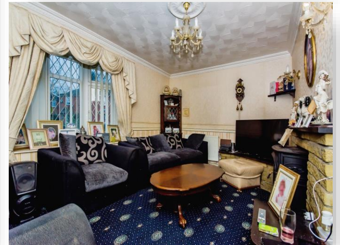
Seabank Road, Wisbech PE13 3UW