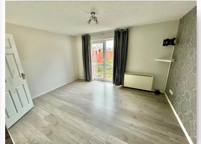
Mikanda Close, Wisbech PE13 2TU