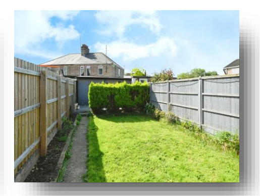
Burdett Rd Victory Rd Victory Rd