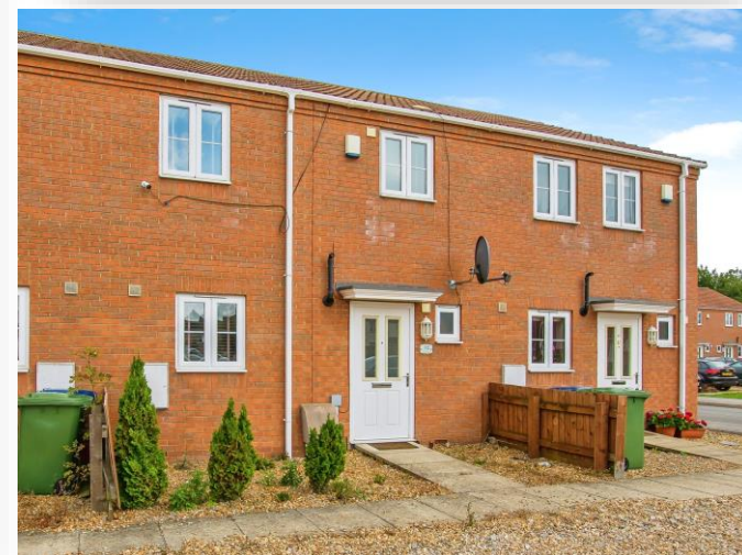
Mikanda Close, Wisbech PE13 2TU