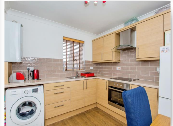
Mikanda Close, Wisbech PE13 2TU