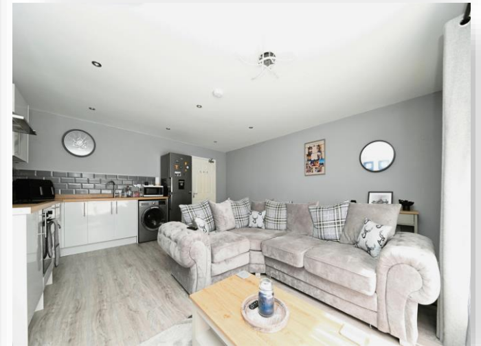
Church Mews, WISBECH PE13 1HL