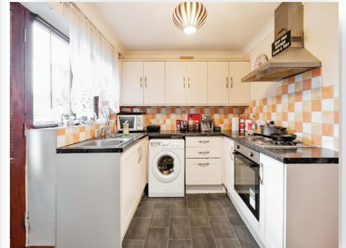
Octavia Mews, Somers Road, Wisbech PE13 1JF