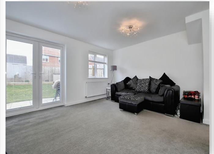
Sayers Crescent, Wisbech St. Mary Wisbech PE13 4AS