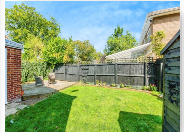
Cattle Dyke, Gorefield Wisbech PE13 4NN