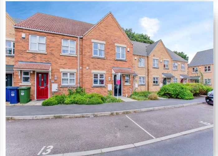
Fenmen Place, Wisbech PE13 3FA