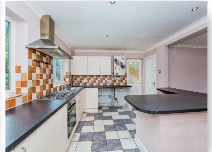
Falklands Drive, Wisbech PE13 2HX