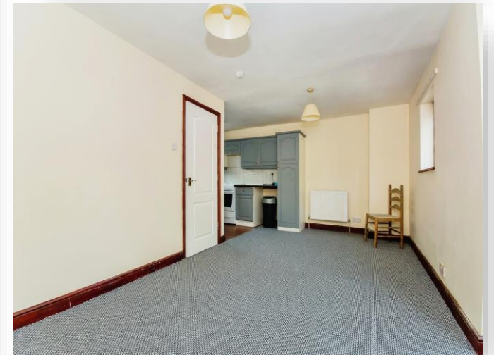
Albion Granary, Wisbech PE13 1HY