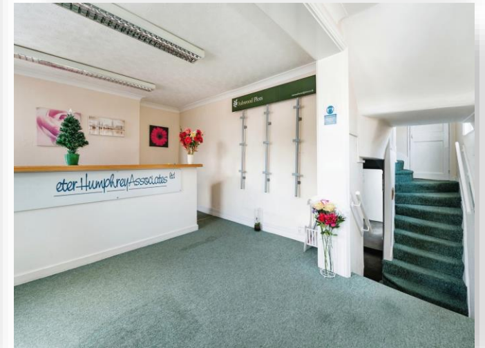
Old Market, Wisbech PE13 1NB