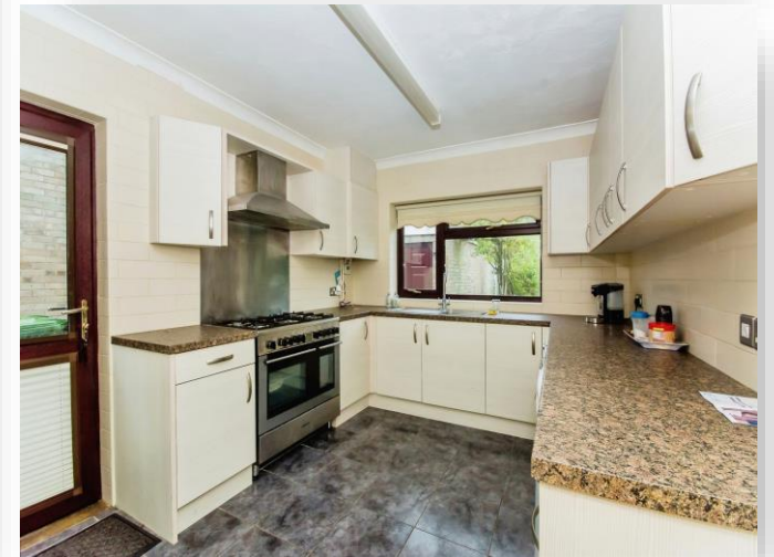
Seventh Avenue, WISBECH PE13 2BN