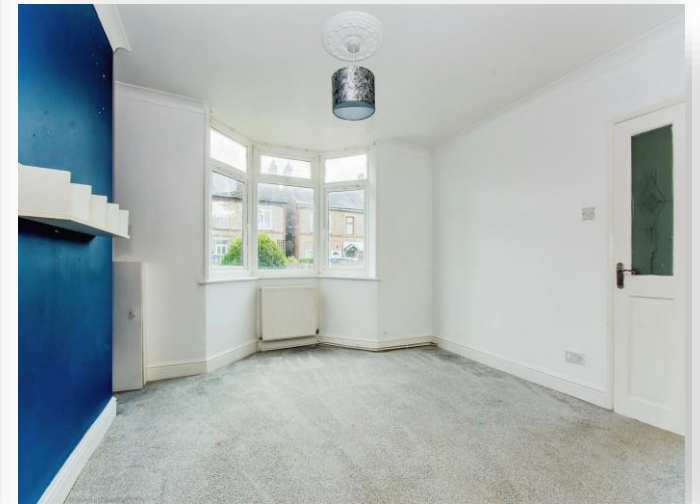
Osborne Road, Wisbech, PE13 3JW